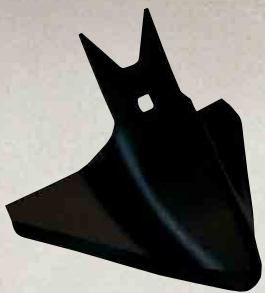
TopMix goose foot point

With shallow stubble working the volunteers germinate. Deeper working loosens the ground and provides more soil for the mixing process in heavy straw conditions. With the choice of points available the best combination can be selected for every condition.