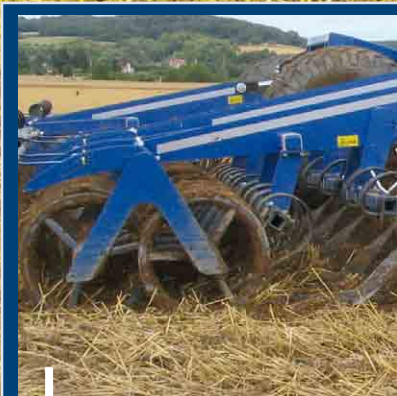
4 | Spring levers