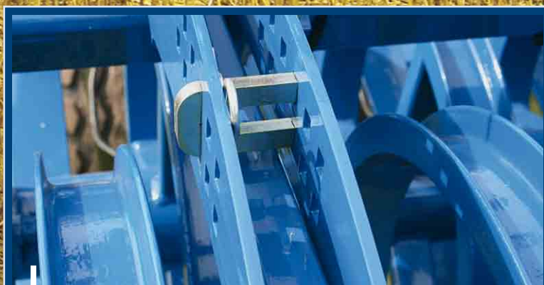
3 | Adjustable following harrow