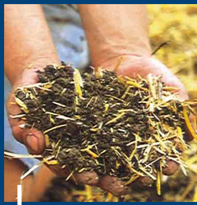
Optimum straw soil mixing

Optimum straw mixing: min till relies on thorough straw mixing for the best results. The harvest residues no longer are left on top and the right cultivation depth can be chosen to suit the following crops and the amount of straw. Compared to previous 4 bar cultivators the Vector leaves a much finer crumble and therefore the ideal germination conditions.