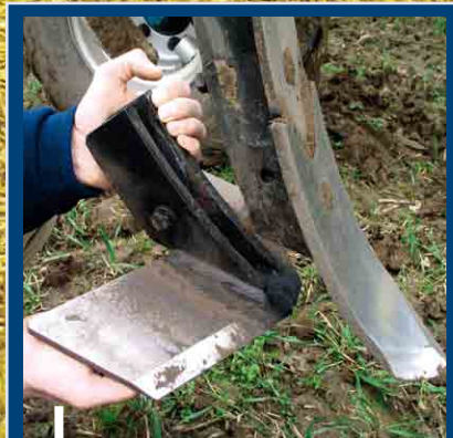
5 | Topmix points